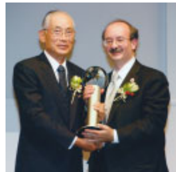
Dr. Amory B. Lovins