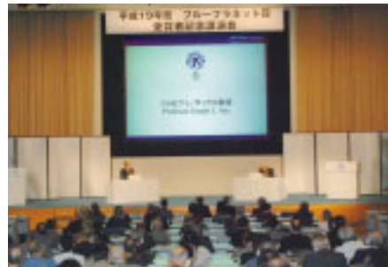
Blue Planet Prize Commemorative Lectures