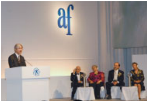
His Imperial Highness Prince Akishino congratulates the laureates