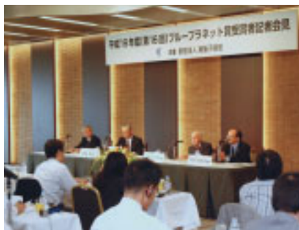
The prizewinners meet with the press prior to the awards ceremony