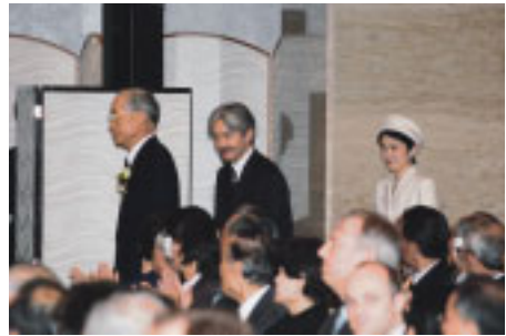
Their Imperial Highnesses Prince and Princess Akishino at the Awards Ceremony