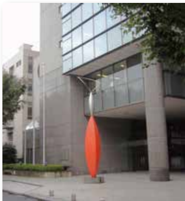
Science Plaza north entrance (The Asahi Glass Foundation on 2nd Floor)