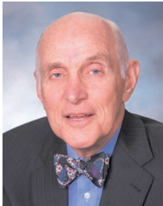
Professor Emeritus, University of California, Berkeley