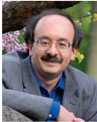
Chairman and Chief Scientist, Rocky Mountain Institute

For the last forty years and through work in more than fifty countries, Dr. Lovins has contributed to the efficient use of energy and the transition to renewable energy sources in order to protect the global environment. Since the 1970s, when he first advocated the concept of the "soft energy path" that forms the basis of these objectives, he has consistently advocated and implemented pioneering ideas in energy and other fields. Among his achievements is the invention of the ultralight, ultra-energy-efficient Hypercar devised for significant reduction of the burden on the natural environment and the design of buildings with little or no net use of energy. In co-authored works Factor Four: Doubling Wealth—Halving Resource Use (1997) and Natural Capitalism: Creating the Next Industrial Revolution (1999), he showed how to double wealth and halve resource use by quadrupling resource productivity (production of goods and services per unit of resource input), and the importance of natural resources and the ecosystem. The broad reach of his activities shows the way towards resolving today's intricately intertwined issues of energy, environment, resources, development, and security.