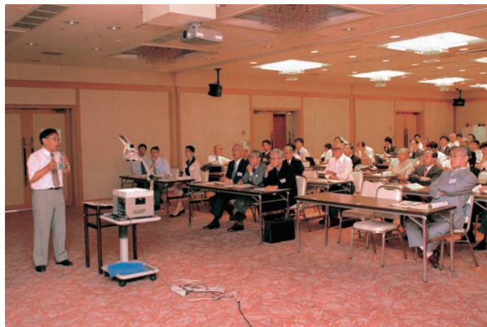
Three-minute speeches in the presentation hall