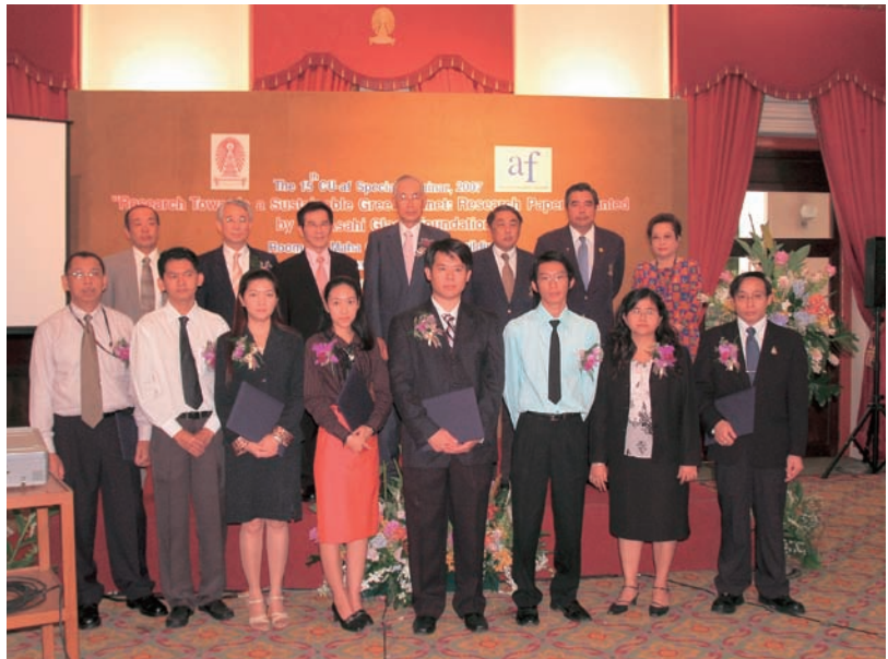
Grant recipients with Chulalongkorn University and Asahi Glass Foundation personnel

Afterwards, a total of nine seminars reporting on the outcome of the previous year's research were held in two lecture halls, one for medical and general science and the other for environmental management and waste research.