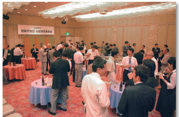
Party after the seminar