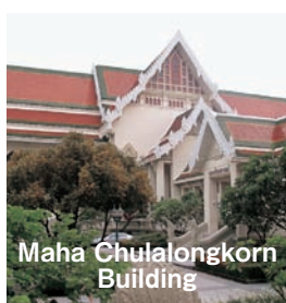
Maha Chulalongkorn Building