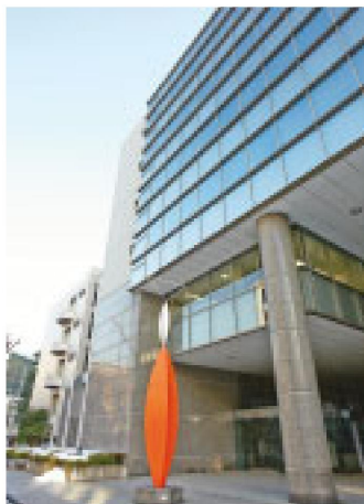
The Asahi Glass Foundation's home is in Tokyo's Science Plaza Building.