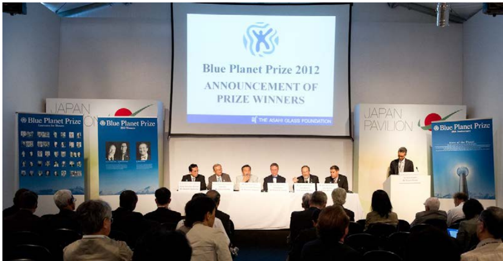
Press conference with winners at Rio+20 in Rio de Janeiro, Brazil.