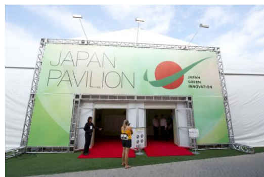
Japan Pavilion ( Conference Venue )

For more information, please contact: Tetsuro Yasuda