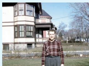
Studied Literature at Harvard University