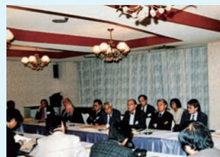
Attended the International symposium held in Tokyo, 1970