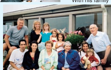
With his family