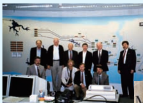
Visiting Turkey while serving as Dupty Assistant Secretary of the U.S. Interior Department