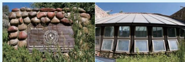
Established Rocky Mountain Institute (RMI) in 1982