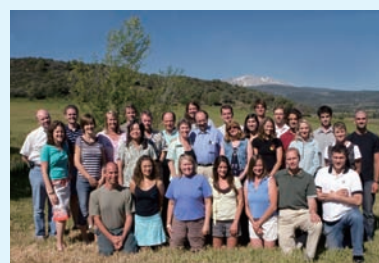
Surrounded by RMI staffs