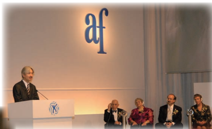
Prince Akishino offers remarks at the Blue Planet Prize Awards Ceremony