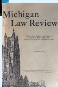
Published an article on public trust doctrine concept, 1970