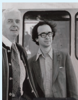
With the request by David Brower (left, 1998 Blue Planet Prize recipient), served as British Representative for Friends of the Earth