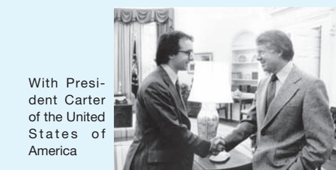
With President Carter of the United States of America