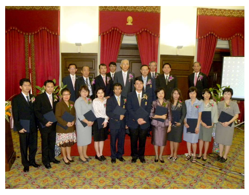
Grant recipients with Chulalongkorn University and Asahi Glass Foundation personnel