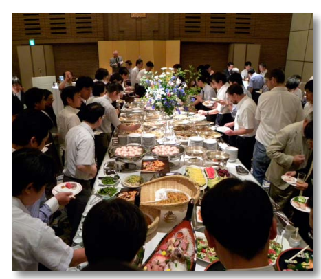
Party after the seminar