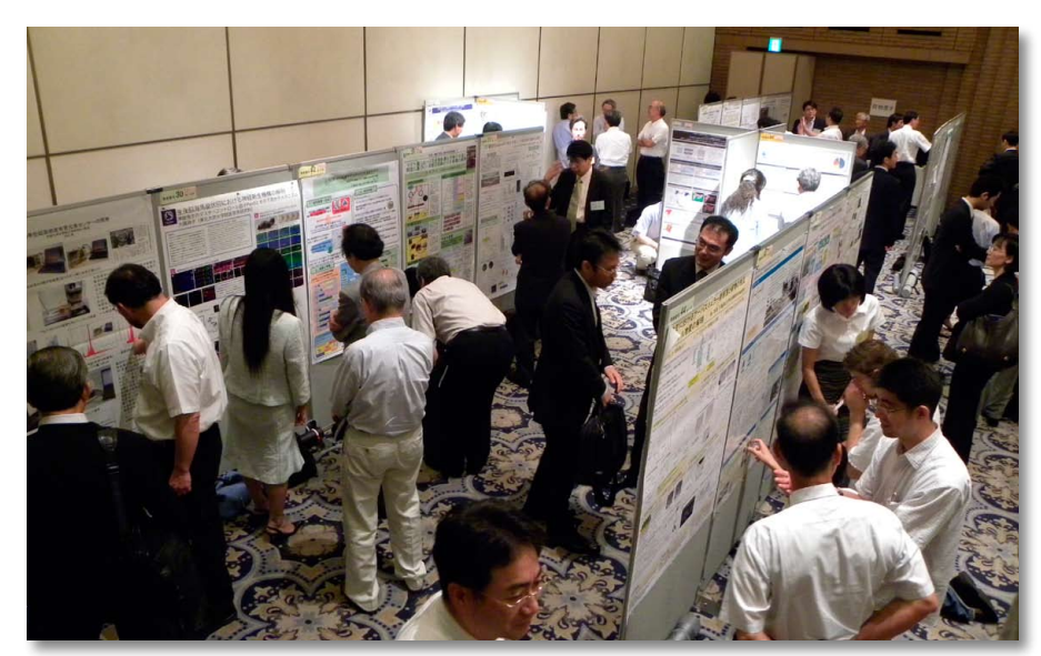
Poster presentation venue