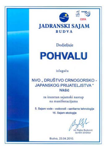
Excellence prize certificate