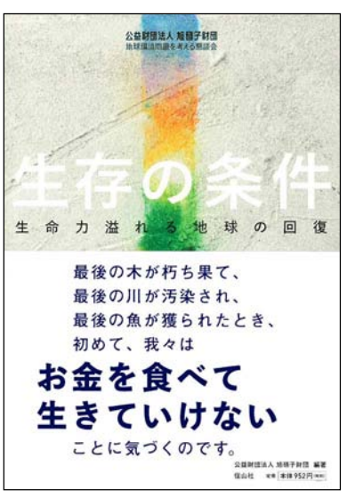
The commerciallyavailable edition