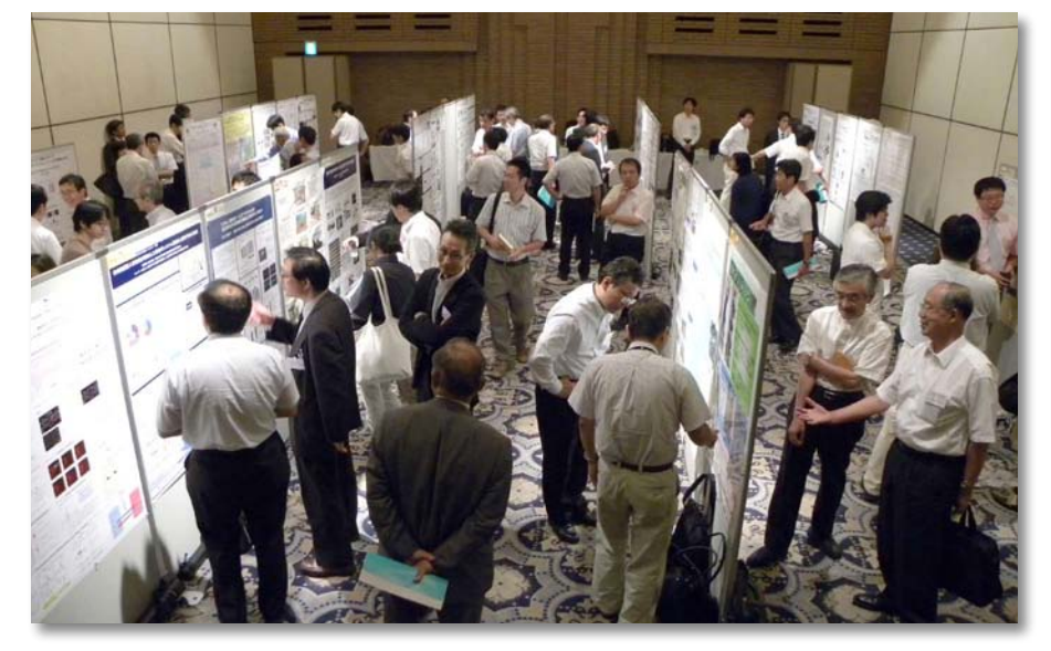
Attendees view the posters