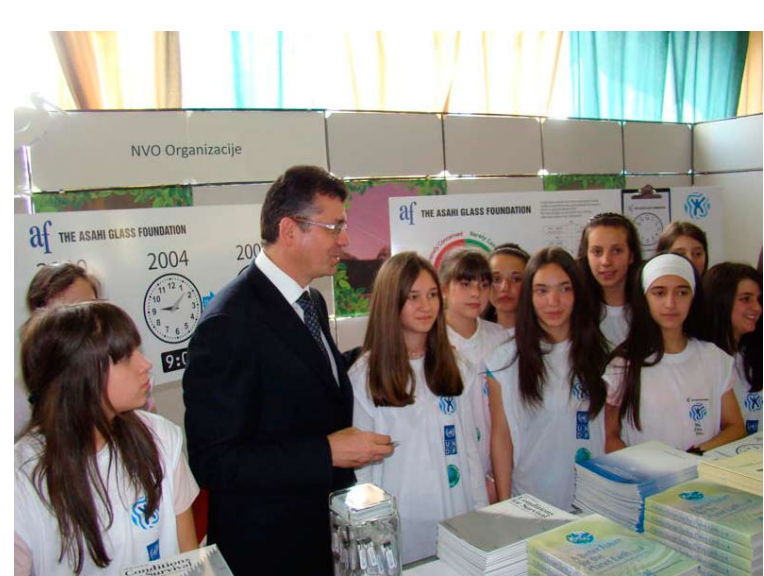
Environmental Minister Gvozdenovic and students who participated in the fair