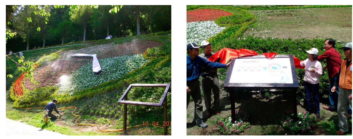
The Environmental Doomsday Clock and notice board installed in the Small Swiss Garden of Cingjing Farm (Nantou County, Taiwan)

On April 17 of this year, the President Chain Store Corporation (Taiwan 7-eleven) planted trees in a highland area of Nantou County, Taiwan in cooperation with groups including the Good Neighbor Foundation Taiwan, which is run by Taiwan 7-eleven. As part of the tree-planting program, an Environmental Doomsday Clock was made out of flowers and grass. A notice board was installed next to the clock to inform the Taiwanese people of the importance of environmental issues.