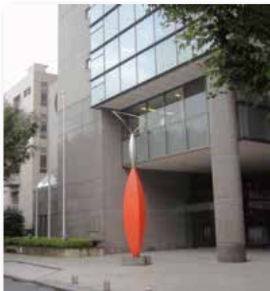
Science Plaza north entrance (The Asahi Glass Foundation on 2nd Floor)