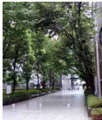
Science Plaza south entrance (Coming from the Joshi Gakuin side)