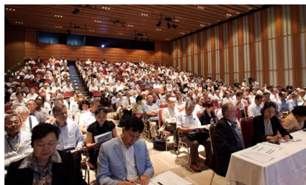
The video of the symposium is posted on the website of the Asahi Glass Foundation. (Voices are original without oral translation)