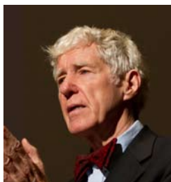
Lester R. Brown (USA) President and Senior Researcher, Earth Policy Institute (BPP laureate for 1994)

The following are summaries of the statements made by the panelists in their talks and in the panel discussion.