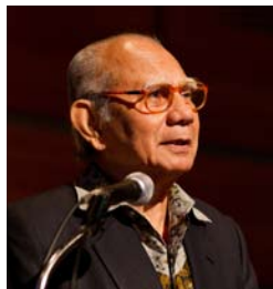
Dr. Emil Salim (Indonesia) Chairman of the Advisory Council to the President Member of the Senate Board of the University of Indonesia (BPP laureate for 2006)

July 7, 2011, 14:00-17:30 Keidanren Kaikan (Otemachi, Chiyoda-ku, Tokyo)